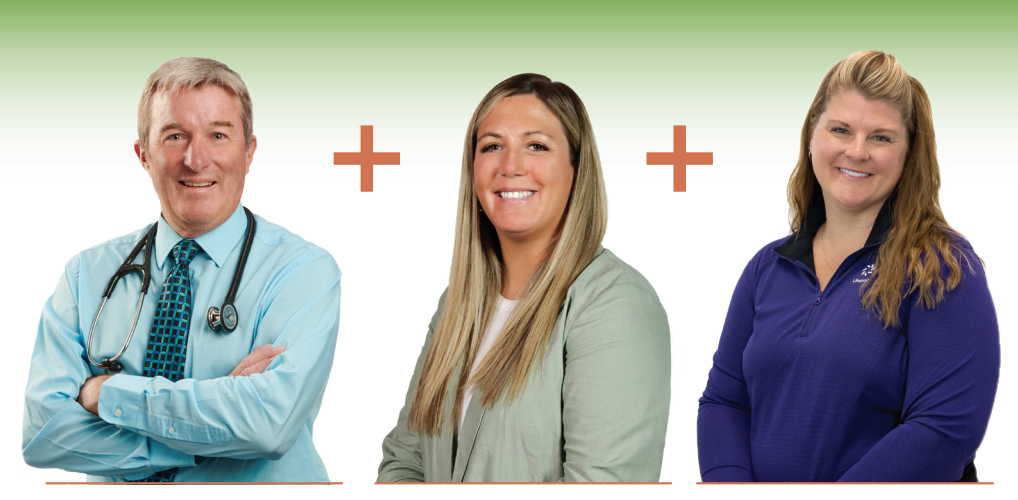
Expert In-Home Primary Care